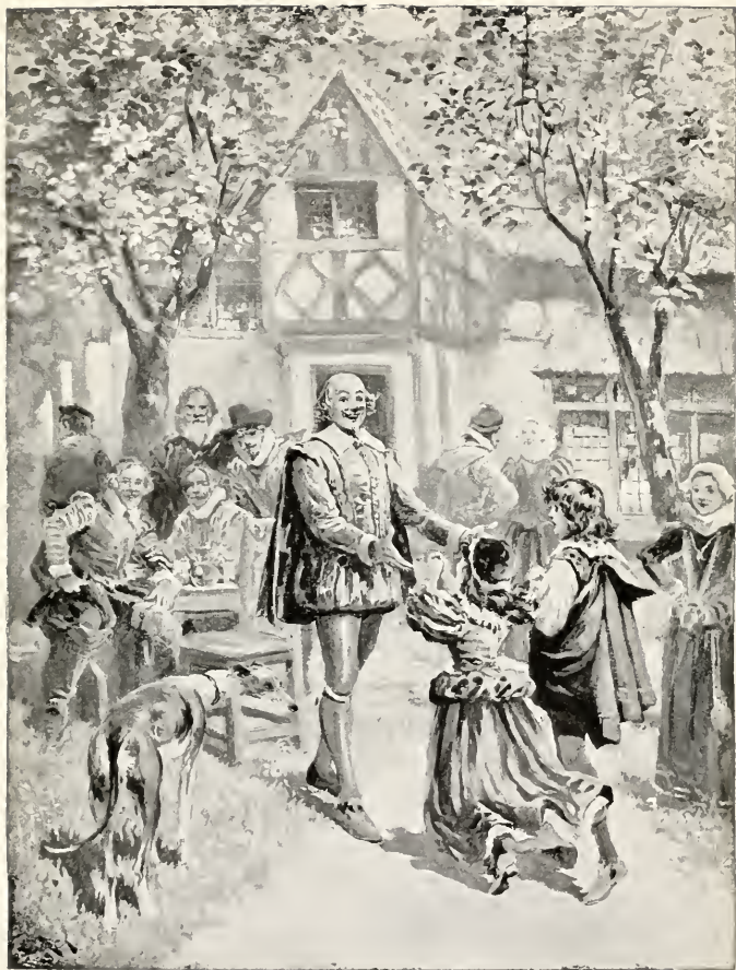
Master Shakespere met them with outstretched hands.